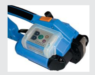
Protection cover for touchpanel for harsh use in industrial environment